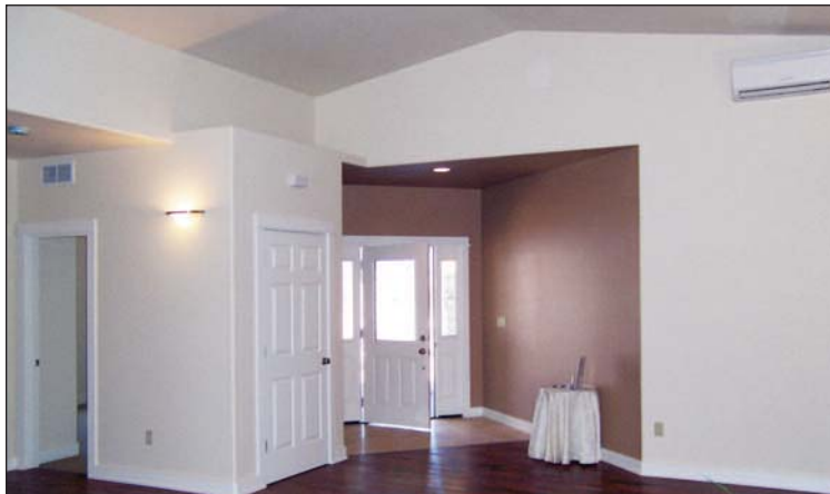
Photo shows AireShare™ blower grille above door on left and air handler for ductless split system at upper right corner.

Using a split system was an ideal way to achieve the level of energy conservation the contractor was looking for. However, Nied recognized the downside of using the system in four or more room applications. "Typically there's a vent in every room with a conventional heat pump system. But with the split system we used, we were limited to heating and cooling only three rooms. This meant air handlers in the main living room, kitchen and master bedroom, leaving two or sometimes three rooms without any conditioned air."